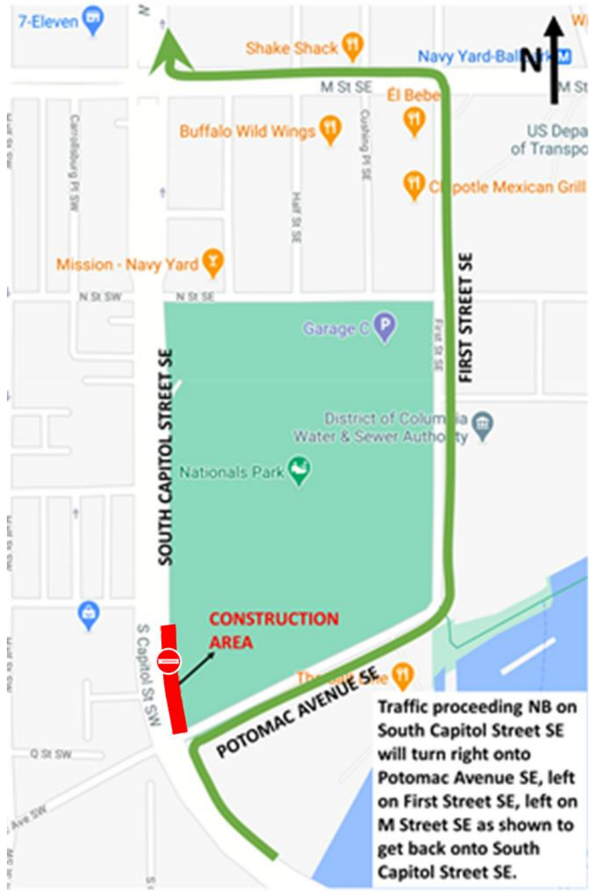
NB South Capitol Street SE Closure & Detour at Potomac Avenue SE

Northbound South Capitol Street SE between Potomac Avenue SE and P Street SE will be closed on both Saturday, March 20 and Sunday, March 21 from 5:00 a.m. to 8:00 p.m. as shown in the graphic. A marked detour will be in place during this closure.