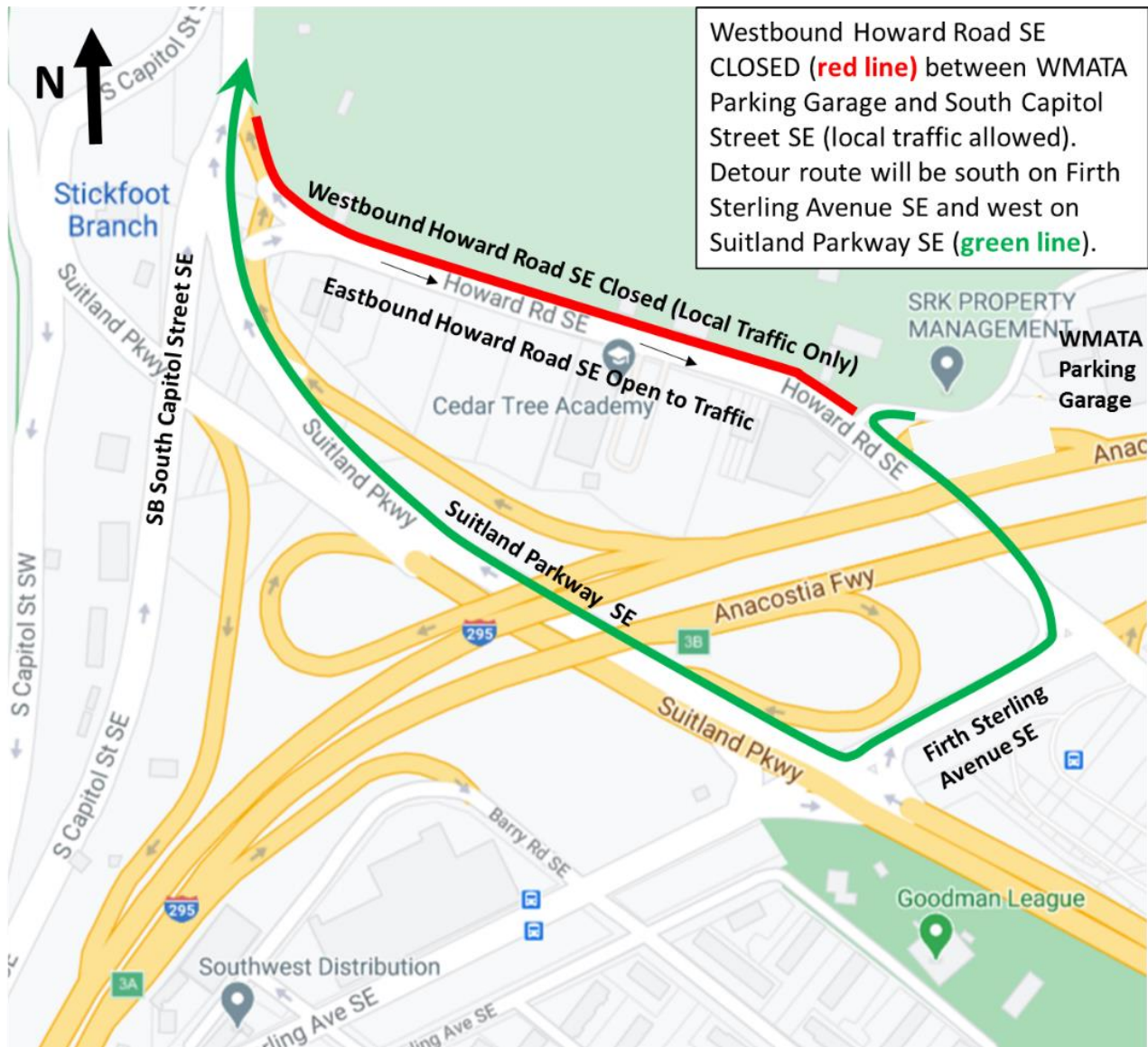
Daytime Westbound Howard Road SE Closure & Detour

On Thursday, February 25, 2021, this segment of Howard Road will also be closed in the westbound direction only between 10:00 a.m. and 5:00 p.m. For these closures, pedestrian and cyclist access to Anacostia Metrorail Station remains unchanged. However, pedestrians and cyclists are advised to stay alert and follow signage when traveling through this area as well as the surrounding construction areas.